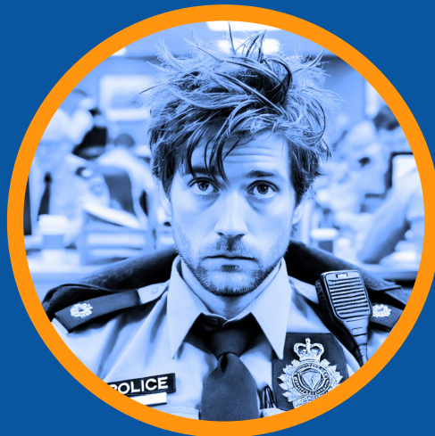
You Are Already Tapped To Capacity