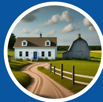
Cellular Dead Zones