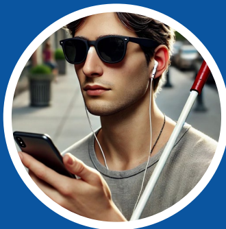
People With Disabilities