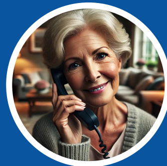
Technology Comfort Levels