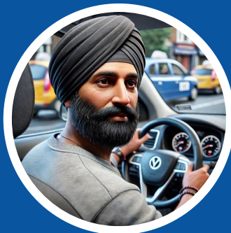
Non-English/ French Speakers